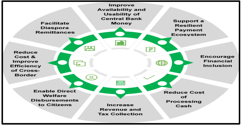
Figure 3. Benefits of eNaira in the Financial Ecosystem